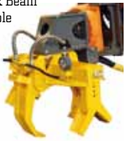
Brokk Beam Grapple