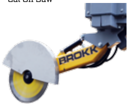
Cut Off Saw

**Requires two extra hydraulic functions