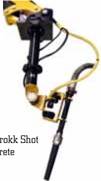
Brokk Shot Crete